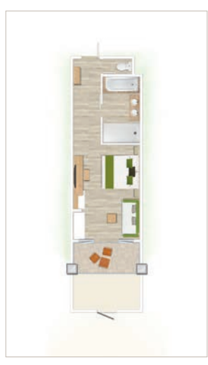
Superior Room / Superior Beachfront