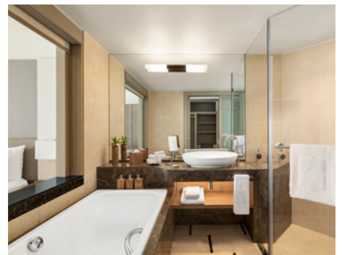
Deluxe Coral Room - Bathroom