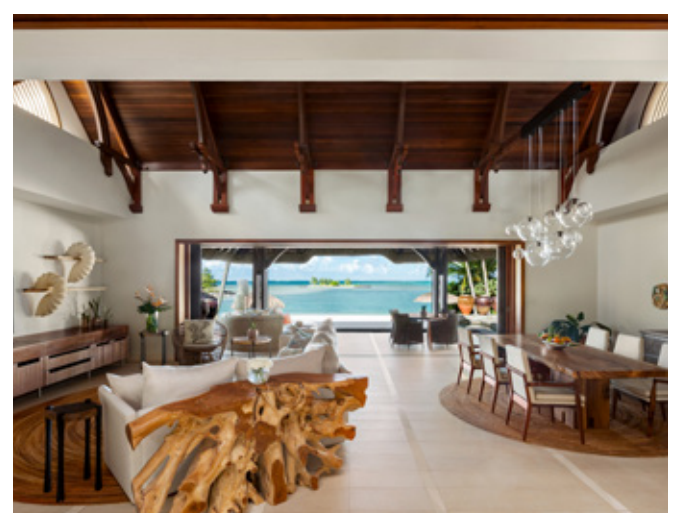
Shangri-La Three Bedroom Beach Villa - Living room