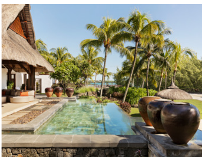
Shangri-La Three Bedroom Beach Villa - Terrace