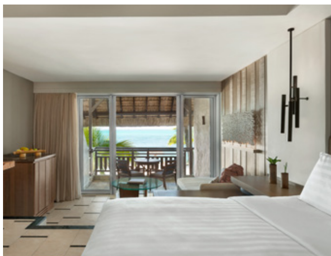
Deluxe Coral Room Ocean View