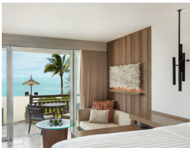
Deluxe Coral Room Beach Access