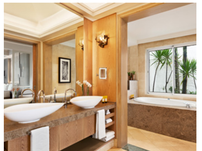
Shangri-La One Bedroom Suite - Bathroom