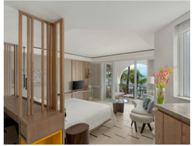
Junior Suite Frangipani Club Ocean View