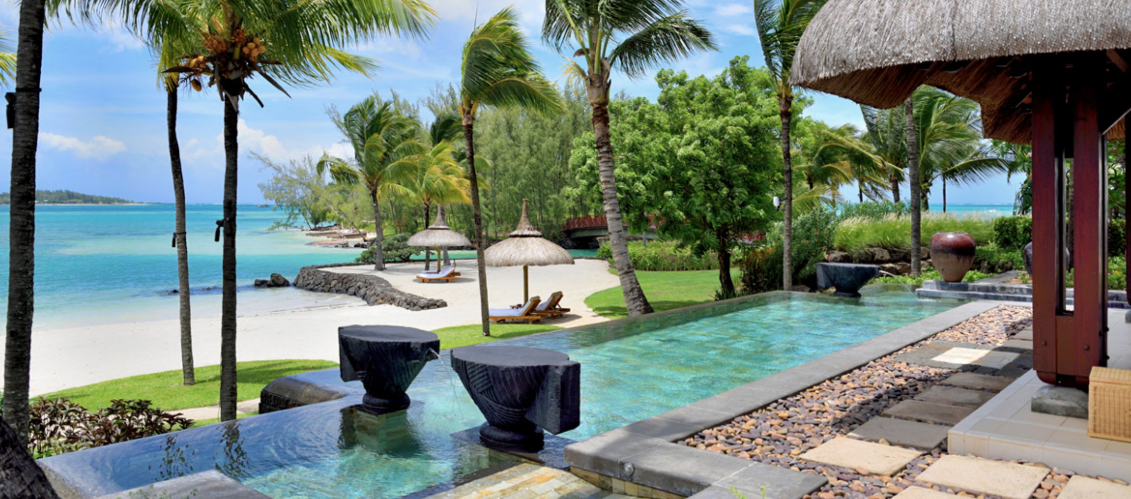
Shangri-La Three Bedroom Beach Villa