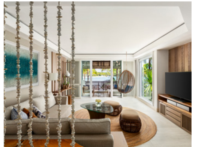
Frangipani One Bedroom Suite - Living Room