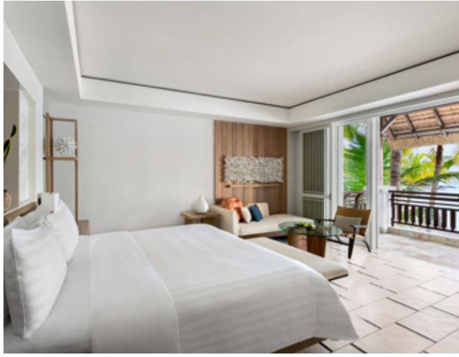
Junior Suite Hibiscus Ocean View