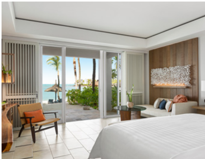
Junior Suite Frangipani Club Beach Access