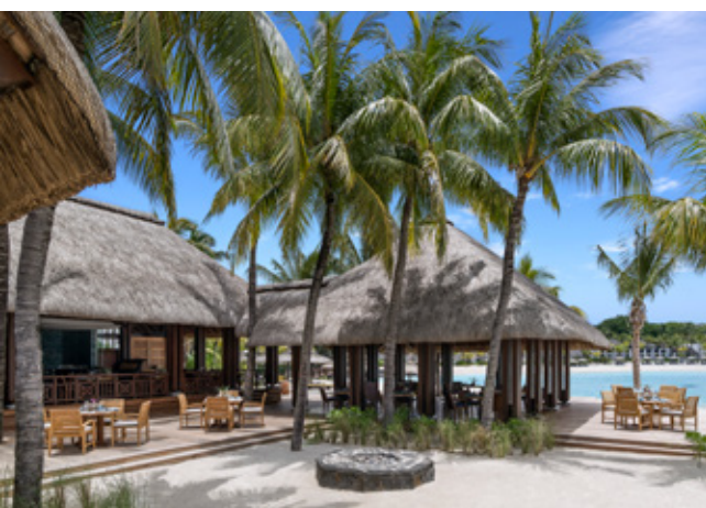
Republik Beach Club & Grill