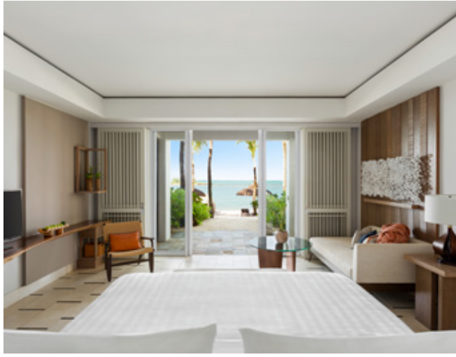
Junior Suite Hibiscus Beach Access