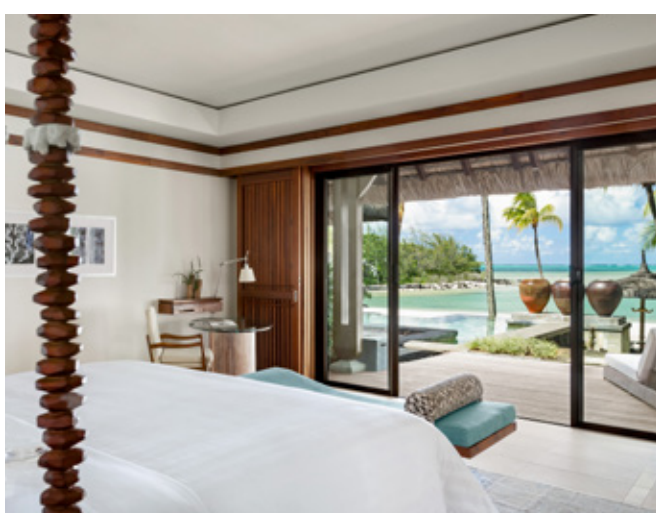
Shangri-La Three Bedroom Beach Villa - Bedroom