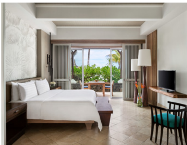
Shangri-La One Bedroom Suite - Bedroom