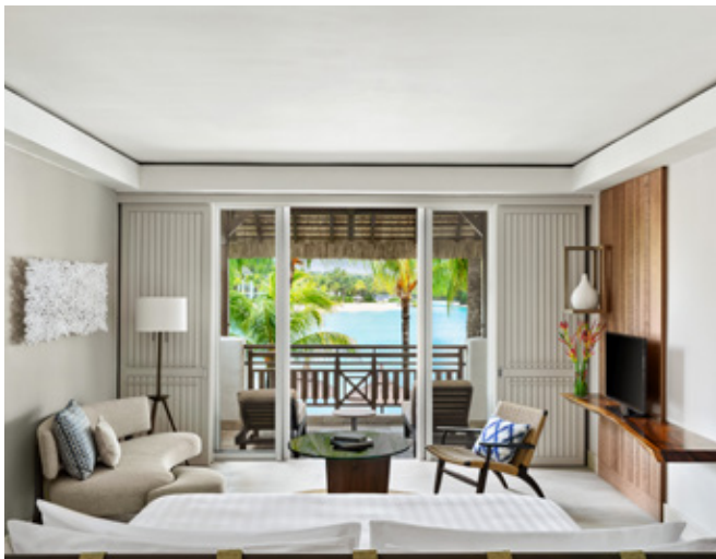
Frangipani One Bedroom Suite - Bedroom