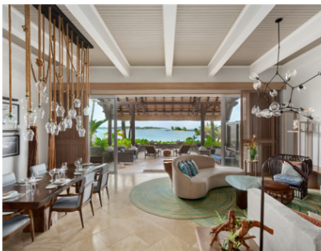
Shangri-La One Bedroom Suite - Living Area