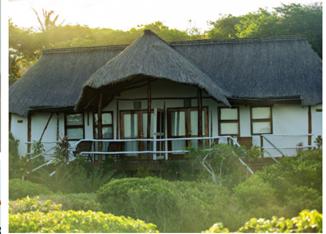
B-unit exterior. One common shared wall no inter-leading doors.