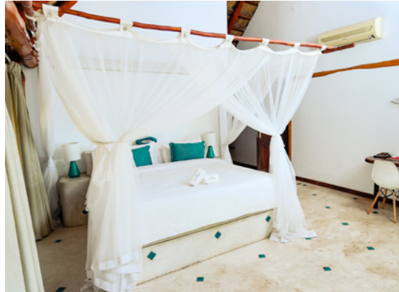
Interior Bungalow. Open Plan with an en-suite bathroom complete with hotel complimentary amenities.