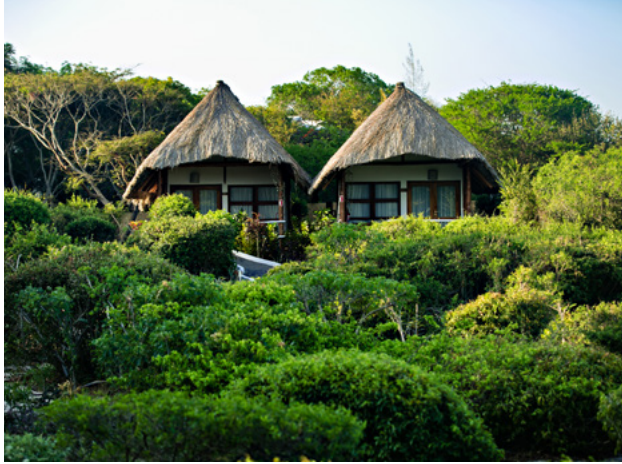
Freestanding A-unit exterior.